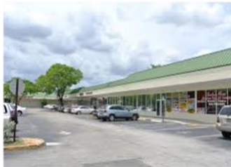
Acquisition Financing $1.5MM Purchase for AAPA, Properties, LLC