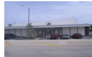
Refinancing Refinance of Ballooned Note for Federal Millwork, Inc.