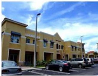
Acquisition Financing Distressed Purchase for Hear 4Kidz, Inc.