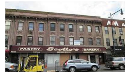
3-Year Bridge Financing Recapitalization on $4.5MM Located 4012 13 th Ave Brooklyn, NY